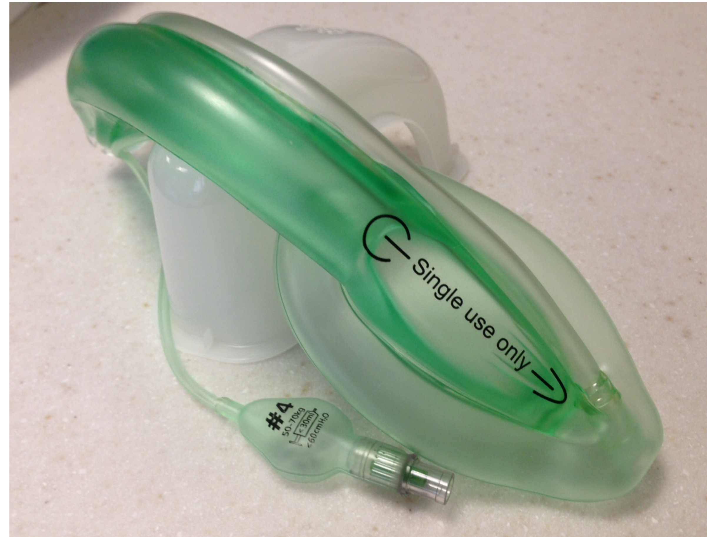
Figure 1. Size 4 Ambu AuraGain Supraglottic Airway Device

Oropharyngeal leak pressures reported were generally high, with median values of at least 25 cmH 2 O seen across all sizes (see box and whisker plot).